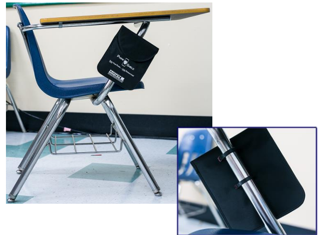
Attach with Grip Ties to Desk Arm or Leg