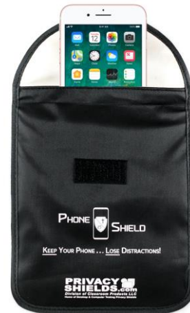
Insert Phone and Close with Velcro Seal

PRIVACY SHIELDS.com Division of Classroom Products LLC