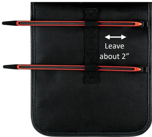
Insert GripLockTies into Slots